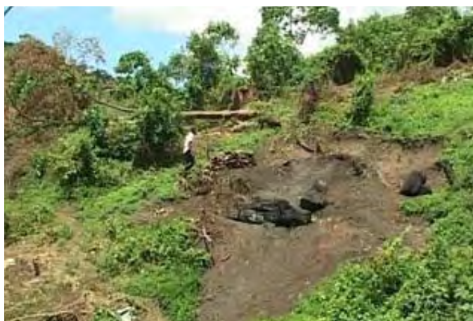
A section of land deforested for charcoal burning