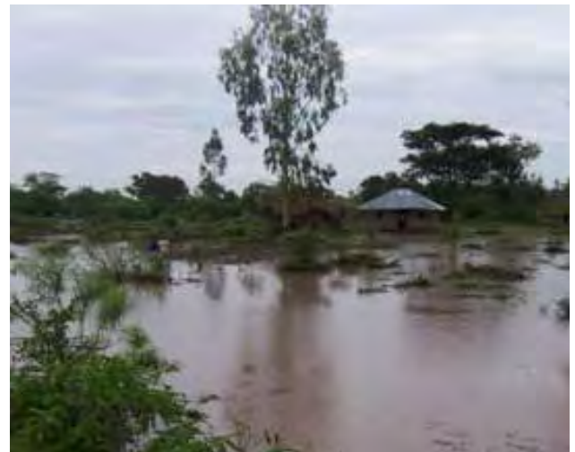
Flooding in Kano Plain, Kisumu

The majority of dams (75%) are developed and operated to irrigate land and generate power. In many cases, these dams have provided profits and a range of benefits. At the same time, dams have negatively impacted people living near them and the surrounding environment. As such the development of water resources using dams has created many conflicts of interest and it is becoming increasingly