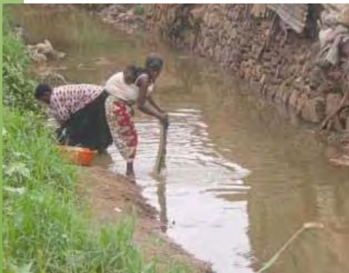
Water and community hygiene problems along River Nyabarongo in Rwanda

In Rwanda , RNDF's the biggest involvement so far is with the NBI NELSAP-Kagera Project. RNDF has had several meetings with the NELSAP project to find synergies within their work plans and activities. In addition, RNDF in collaboration with CBSI and NTEAP recruited one of their member organizations, ISUKU, to carry out awareness raising activities on the environment on behalf of NELSAP. RNDF drafted the terms of reference for this consultancy work. The NDF has also been included in the NBI Applied Training Program, ATP, and Integrated Water Resource Management (IWRM) trainings.