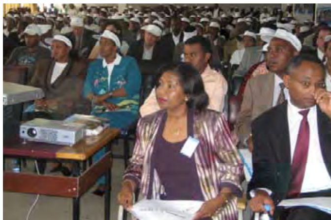
World Water Day Celebrations in Ethiopia

As an outcome of these workshops, a course, "History