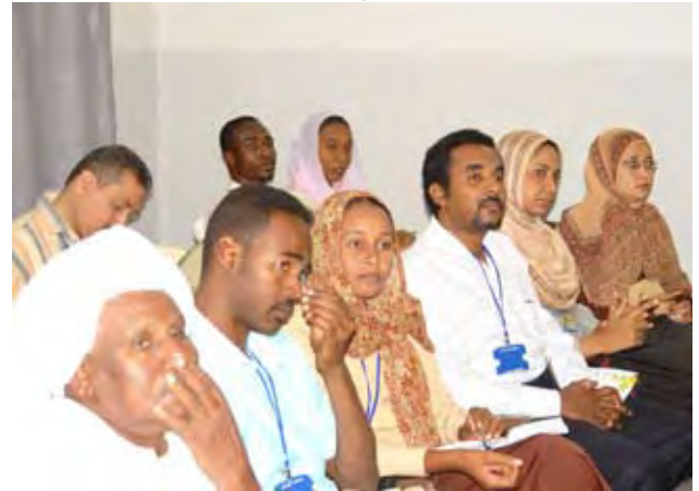
Participants at the Kassala workshop in Sudan

Sudan NDF was involved in quite a number of activities in the second phase of the program. The NDF organized a water borne disease Workshop which highlighted Water diseases in Sudan scattered along the Nile. Findings at the workshop revealed that Bilharzias is top on the list with most infections in all cities along the Nile in Khartoum.