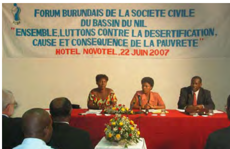
Workshop on desertification and poverty in Burundi

The move to sensitize decision makers on the problem of water resource management in Burundi during the debates interested one of the NBI Projects in Burundi, The Nile Trans-boundary Environmental Action Project (NTEAP), to join BNDF in creating awareness on this issue. Through the use of the media, BNDF lobbied for the important issues that had been raised and this in turn has led to the creation of a proper Ministry of Water in Burundi.