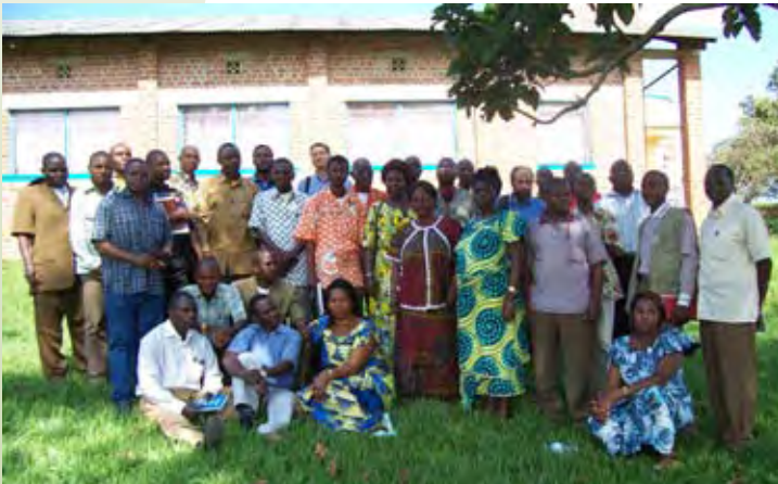
Workshop participants in Bunia, DRC

The city of Bunia is the major city of Ituri district where the DR Congo National Discourse Forum held its public consultation with local stakeholders in September 2007. Ituri district is located in the north of the DRC Nile basin area and comprises among others sites Lake Albert, which is shared by the Democratic Republic of Congo and Uganda.