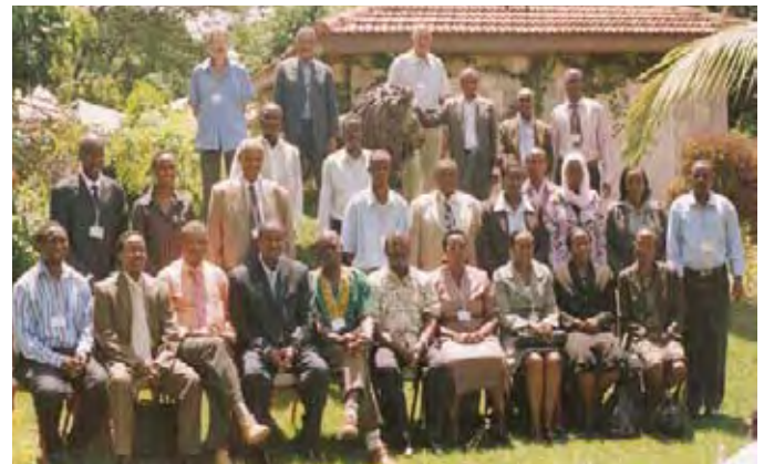
Participants at the GWP NBD & ANEW workshop in Nairobi

It is hoped that this will go a long way in deepening the role of civil society organisations in advocating for IWRM processes and implementation in the region.