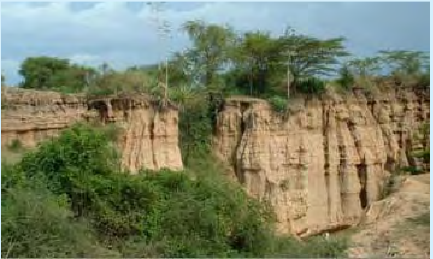
A section of land undergoing heavy soil erosion