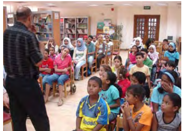
Aqua Parties in Egypt

In Egypt, the Egyptian National Discourse Forum (EgNDF) held a three days workshop with most of the Nile Basin Initiative (NBI) officials in Egypt to establish modes of cooperation and