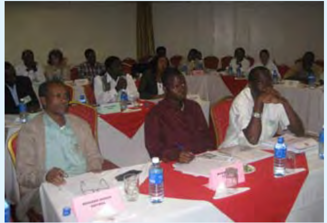
NBD leadership training Nairobi