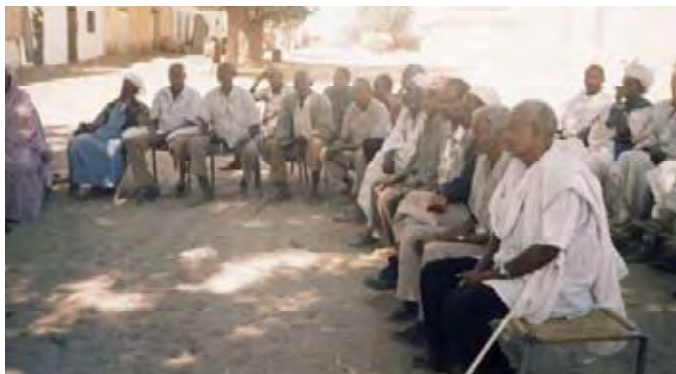
Participants at a farmers' workshop in Eritrea

In Eritrea , one of the Eritrean NDF important objective was to develop strong communication systems especially through conducting public debate