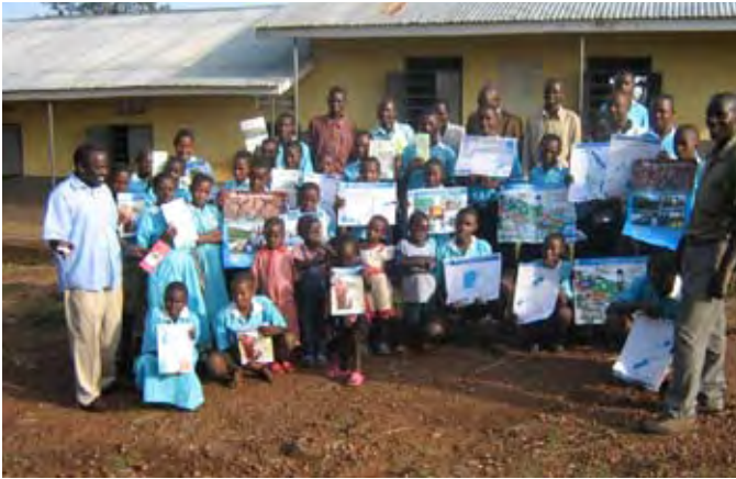
UNDF Schools' awareness raising campaign on the Nile Basin