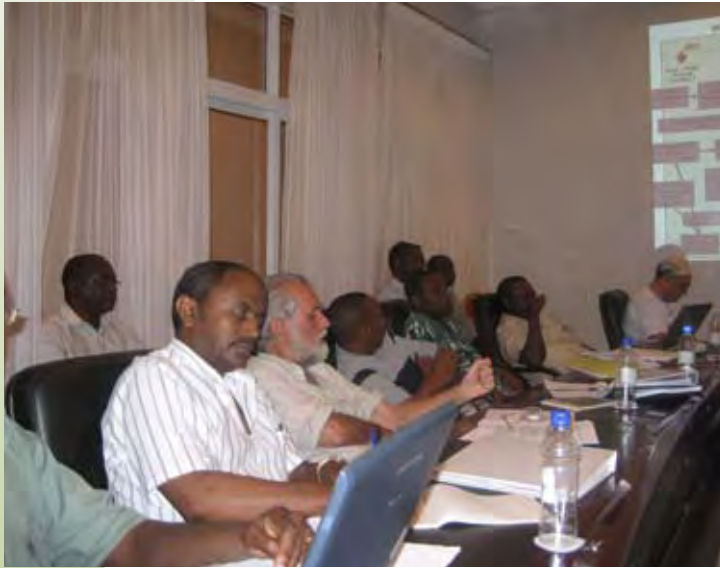
SC meeting in Kinshasa

The consultants' report dwelt on a number of issues related to governance and management and put forward a number of recommendations