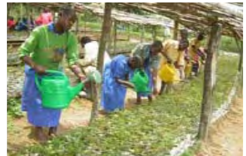
Tree production in schools in Rwanda

The establishment of the Nile Basin Initiative (NBI) was, in the long run, to end the mistrust between governments and replace it with shared vision through implementation of a number of trans-boundary development projects. However, human experience has indisputably proven that without the involvement of civil society at large and communities on the ground, developments projects won't succeed in bringing the desired results. The relevance and practicality of this notion to the Nile basin reality has been the one crucial issue that bedeviled many development practitioners for some time now. The complexities in the involvement of civil society in the NBI projects and in the development process must be contextualized within